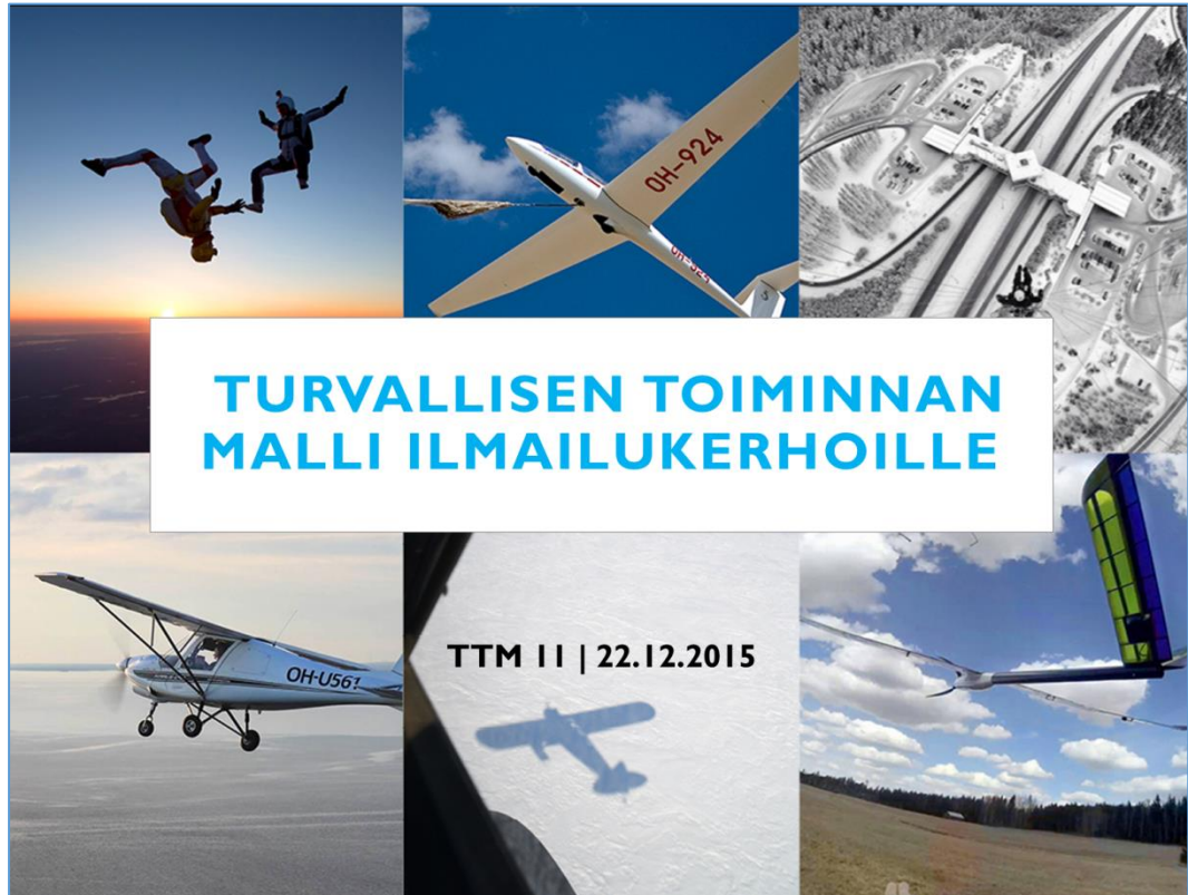
Figure 2: A safe operations model for aviation clubs