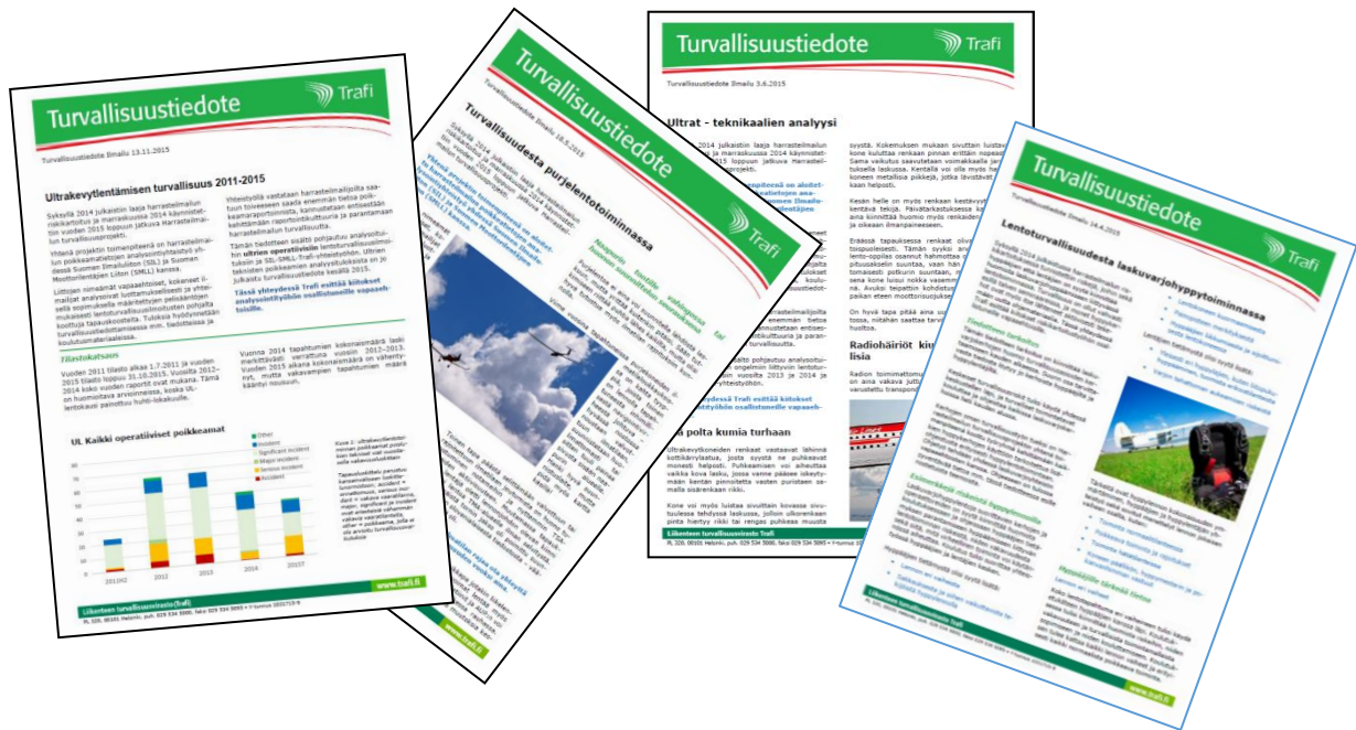
Figure 5: Safety bulletins published as a result of collaborative analysis in the project

The purpose of this action was to involve the community in producing safety information by genre, for clubs and individual aviators. This addressed a long-standing need for more feedback and concrete benefits from occurrence reporting. Trafi and the associations signed an agreement on analysis work. The collaborative analysis resulted in four safety bulletins being published for general aviators (see section 6.8, Publications). The collaboration got off to a good start and was considered useful, and it will thus be continued in 2016. Volunteer analysts are welcome to bring in suggestions and develop new ways of using the data, for instance in training materials and in support materials for clubs.