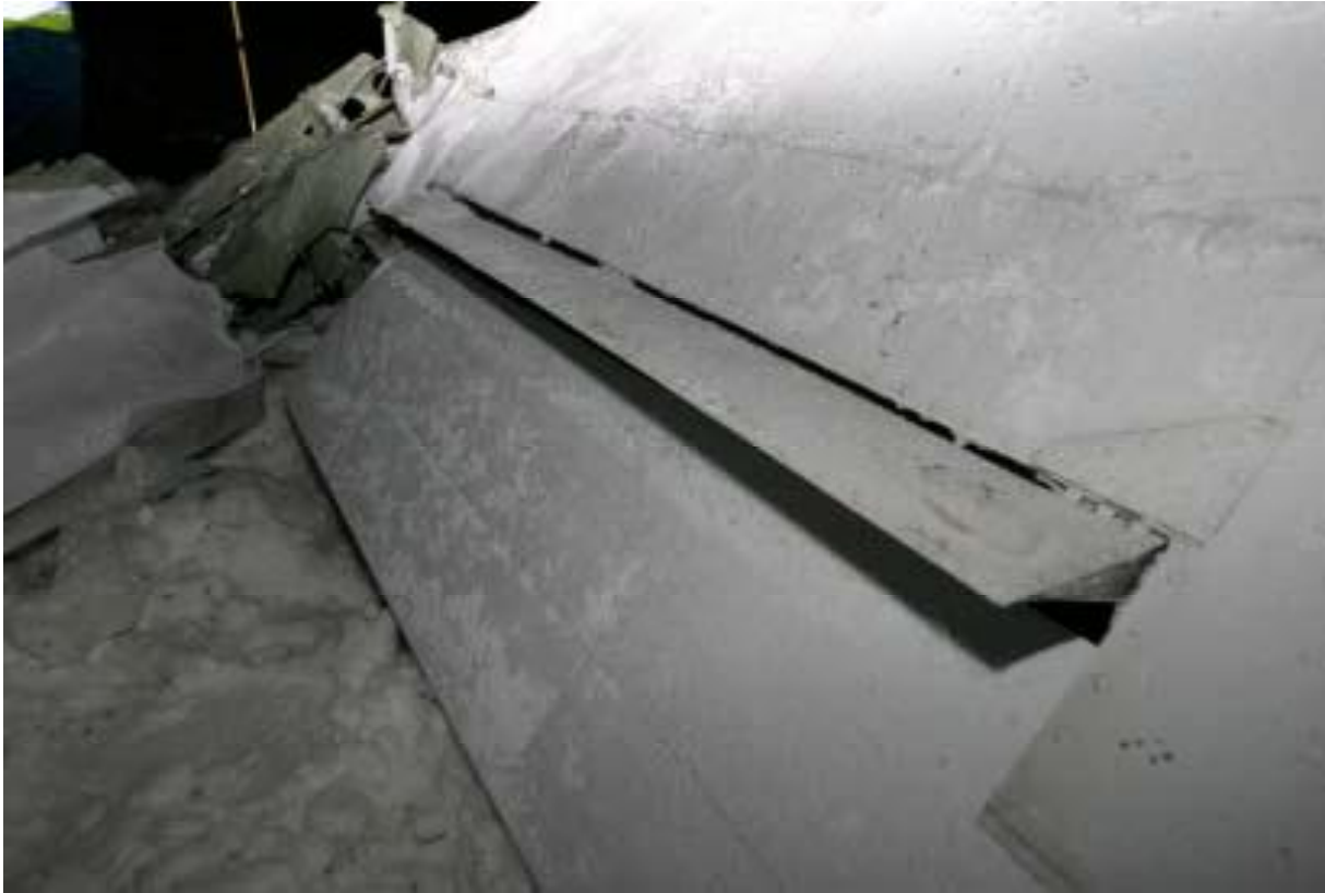
Wing upper surface contamination