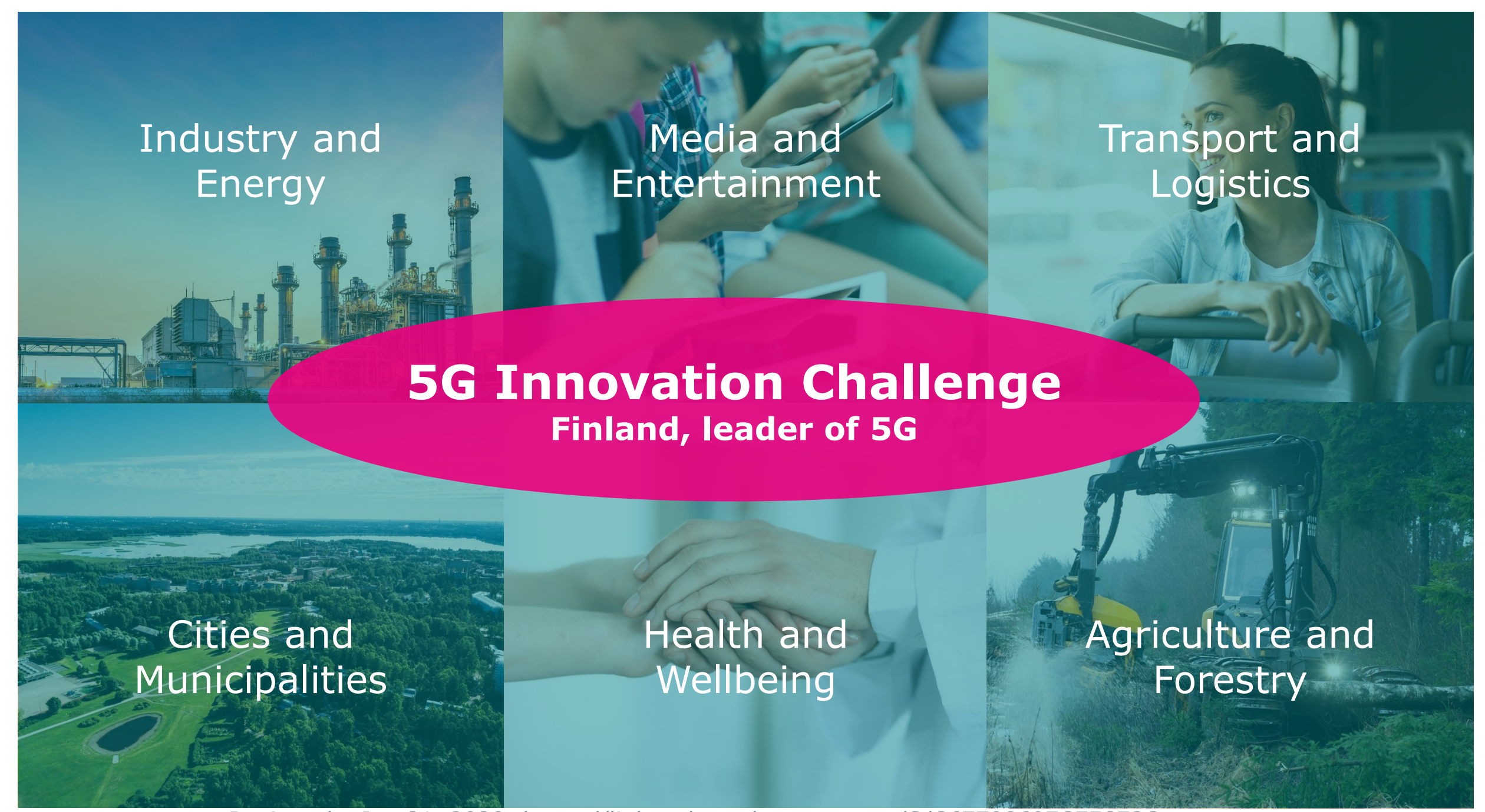
Register by Jan 31, 2020: https://link.webropolsurveys.com/S/C67798697CEFCE3C