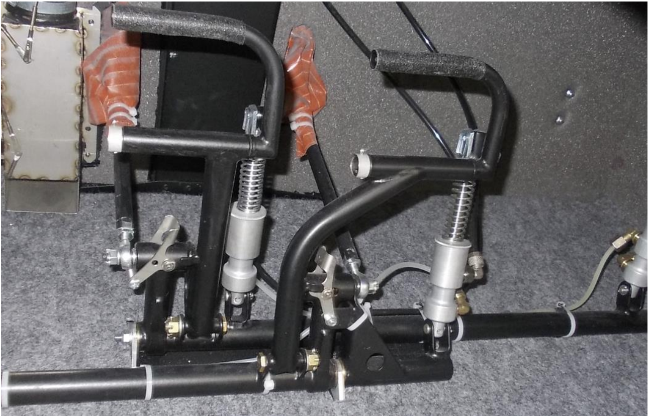
Previous/other model Eurostar